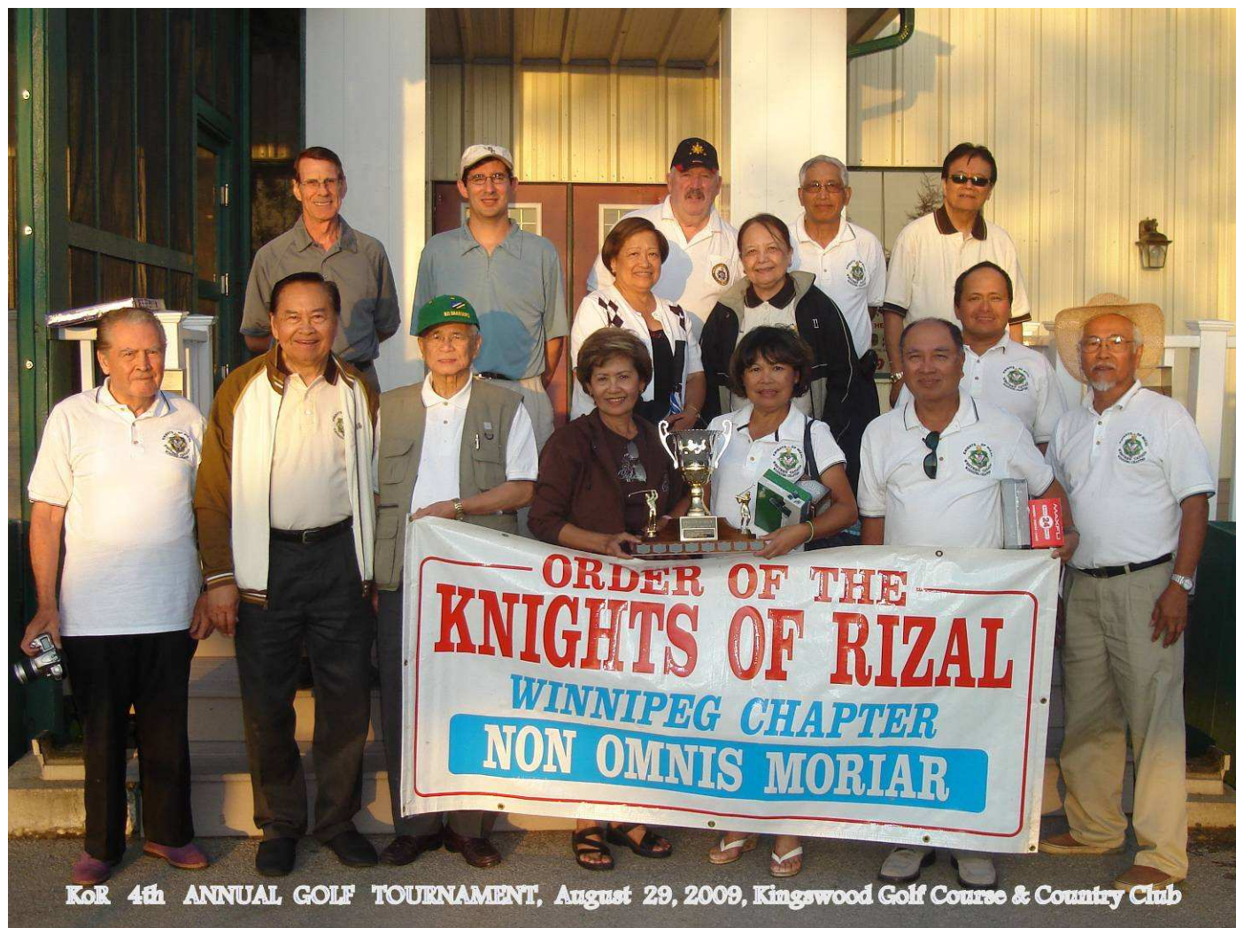
KoR 4th ANNUAL GOLF TOURNAMENT, August 29, 2009, Kingswood Golf Course & Country Club