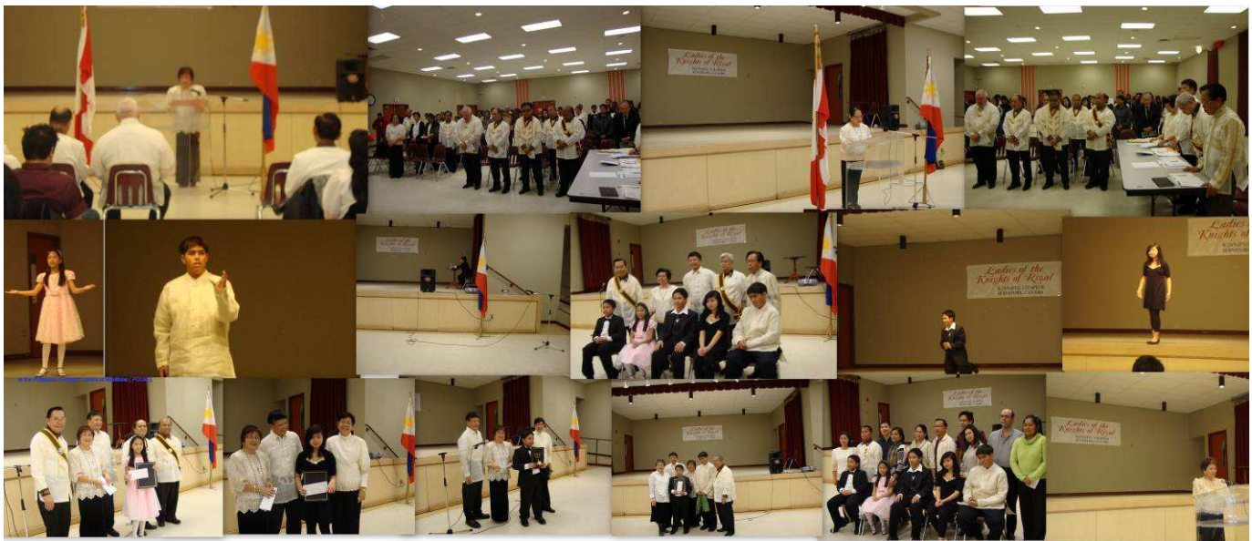
Declamation Contest sponsored by the Ladies of the Knights of Rizal held at the Philippine-Canadian Centre of Manitoba ( PCCM ) on November 29, 2009 .