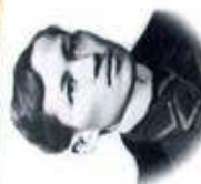
Dr. Jose Rizal