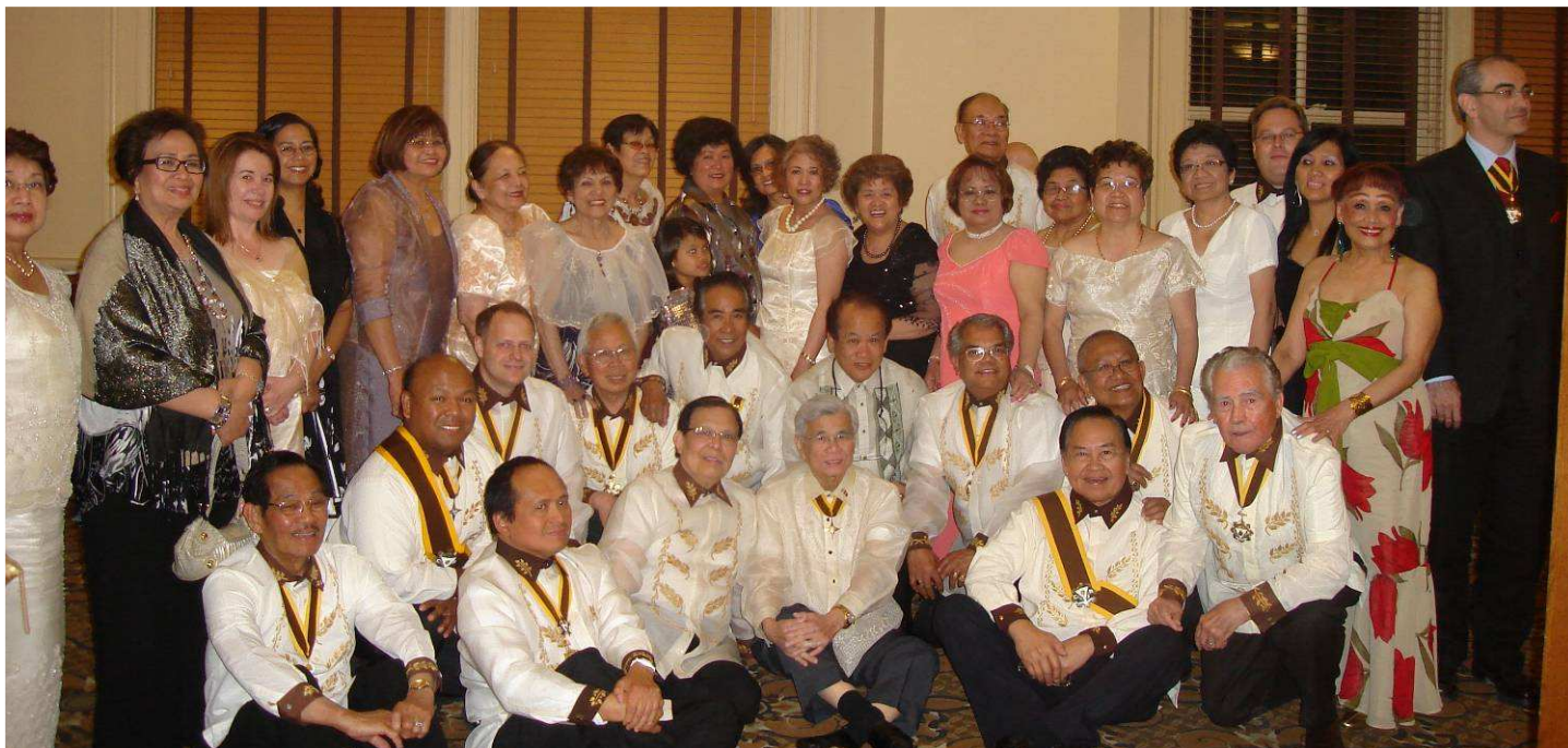
Picture above: KoR Winnipeg Chapter attendees of the Philippines Independence Day Ball held at the Marlborough Hotel June 12, 2009. A series of collages encapsulating the the Heritage Week Celebrations is below.

cultural night and held their presentations and graduations of the MAFTI Rondalla School of Music. June 12, 2009 was when the Philippines Independence Day Ball was held at the Marlborough Hotel at 331 Smith Street. This was the occasion to commemorate the 111 th Anniversary of the proclamation of Philippines Independence. On June 18, again at the PCCM, new comers to Winnipeg were toasted in the event called "Welcome to our Baging Dating". On June 19, 2009, the KoR Winnipeg Chapter formally celebrated the 148 th Birthday of Dr. Jose Rizal, the 4 th Anniversary of the Peace and Unity Agreement of the Order of the Knights of Rizal, and the 1 st Anniversary of the Official Unveiling of the "Dr. Jose Rizal Way" in Winnipeg. The celebration wrapped up with a "Community Picnic" on June 20, 2009 at Assiniboine Park.